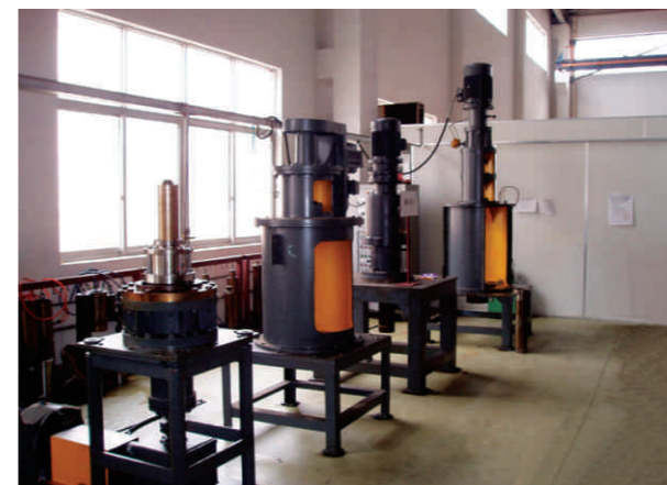
产品测试台 Product Test Board