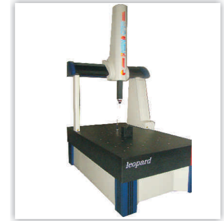
三维检测仪器 3D Measuring Instrument