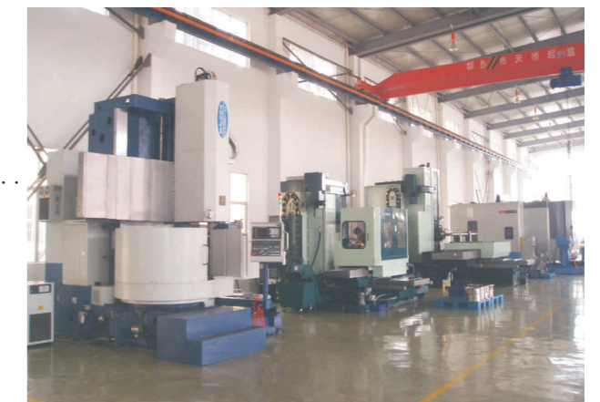
国外进口的先进数控加工设备 Advanced CNC Processing Equipment