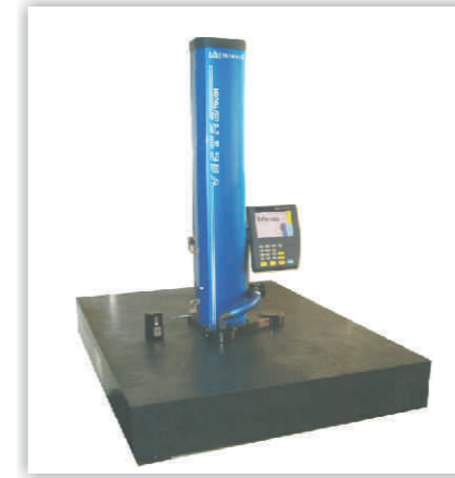
瑞士进口的二次元检测仪器 Quadratic Elements Measuring Instrument Imported From Switzerland