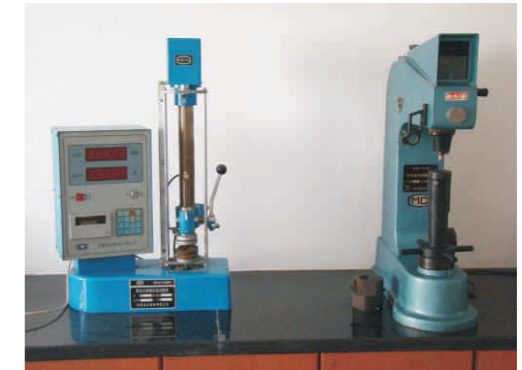
左：弹簧拉压试验机 Spring Pull and Press Tester 右：布洛维光学硬度计 Brinell Optics Hardness Sclerometer